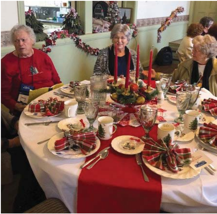
Beautiful table settings!!